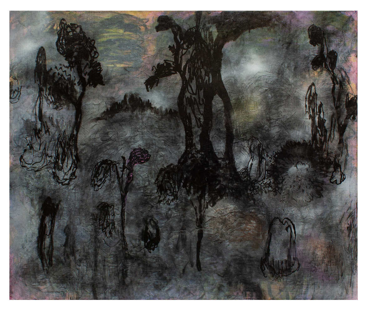
Martin Ålund, The Bipolar Suite #12 (Otherworld) Acrylic on canvas 100x120cm, 2021

painting is challenging since it really depends on the specific context and from which gaze the question is approached. From where I stand, there's my background, experience, my own context and position, both structurally, socially and culturally, to consider. I see a lot of inspiring painting both in Swedish and international contemporary art. I can spot a painterly playfulness among many young painters which inspires me. I also see how great painting of older artists is occasionally found in the spotlight and (re)discovered. Painting as well as other artistic expressions and techniques continue to see light and run forward in the bodies of work of artists and in their studios, no matter how trends come and go.